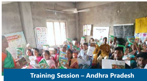
Training Session – Andhra Pradesh

Funded by SEEDAP, ASCI organized 8 to 10-day training programs focused on Zero Budget Natural Farming and Non-Timber Forest Produce, specifically tailored for tribal youth. These initiatives aim to promote sustainable agricultural practices while creating new livelihood opportunities within tribal communities. By emphasizing natural farming techniques, the programs help reduce reliance on chemical inputs, leading to lower costs and improved soil health. Additionally, training in Non-Timber Forest Produce opens up alternative income streams, contributing to economic independence and strengthening community resilience.