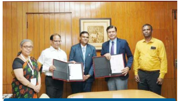
MoU signed between ASCI & NDDDB for a strategic partnership for skill development in the dairy sector on 18 th July 2023