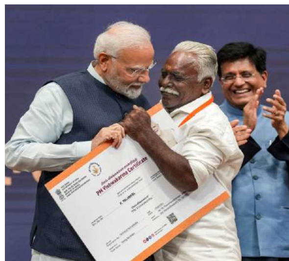
Hon'ble Prime Minister interacting with ASCI "Fishing Net Maker" Trade Mentor and Artisan during PM Vishwakarma exhibition on 17 th September 2023