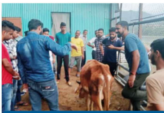
Training Program on the Dairy Farmer Entrepreneur Job Role-Bilaspur (Himachal Pradesh)

Training programs have been launched in the districts of Mandi, Sirmaur, and Bilaspur, with approximately 200 candidates currently enrolled. These programs cover a range of critical areas, including Horticulturist (Protected Cultivation), Floriculturist, Dairy Farmer Entrepreneur, and Aquaculture Worker. Each program is tailored to address specific regional needs and to prepare participants for success in various agricultural and allied sectors.