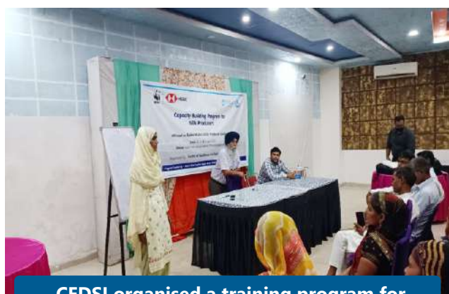
CEDSI organised a training program for Mahila Milk Producer Company in Rajasthan, Supported by WWF

CEASI has also focused on on-ground training programs to enhance the skills of dairy professionals. Collaborations with organizations such as Lactalis - Prabhat Dairy and Reliance Foundation have led to training sessions that improve efficiency, milk quality, and procurement techniques. These programs, conducted in regions like Maharashtra, Telangana, and Karnataka, provided participants with practical knowledge and hands-on experience crucial for refining dairy farming practices.