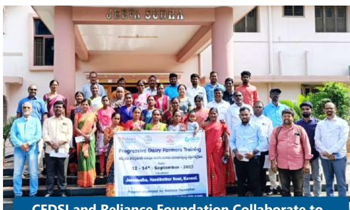
CEDSI and Reliance Foundation Collaborate to Empower Dairy Farmer Entrepreneurs through extensive training

CEASI's efforts extend to empowering rural communities and women entrepreneurs within the dairy sector. Training programs supported by WWF and local dairy cooperatives have addressed key areas such as advanced dairy farming practices, milk quality assurance, and financial management. Held in regions like Rajasthan and Andhra Pradesh, these initiatives aim to boost productivity and profitability, fostering sustainable development and growth within the dairy industry.