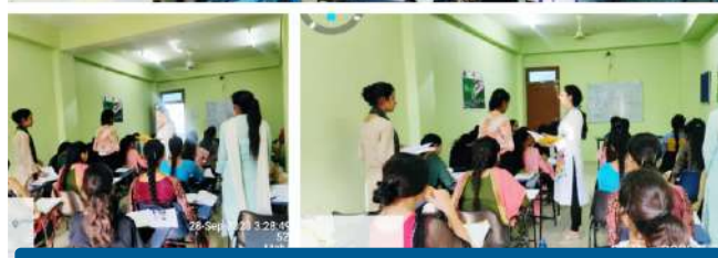
Training Program for the Protected Horticulturist Job Role - Mandi (Himachal Pradesh)